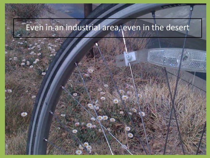
ready to puncture inner tubes.

children coming from parts of northern and central New Mexico and southern Colorado where schools were scarce at the time. The school's website, <u>www.menaulschool.com</u>, tells the story of the alterations in the school's focus over time.